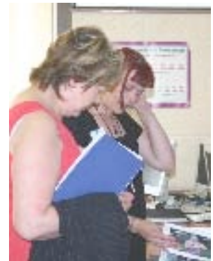
Janet Anderson MP views one of the exhibitions